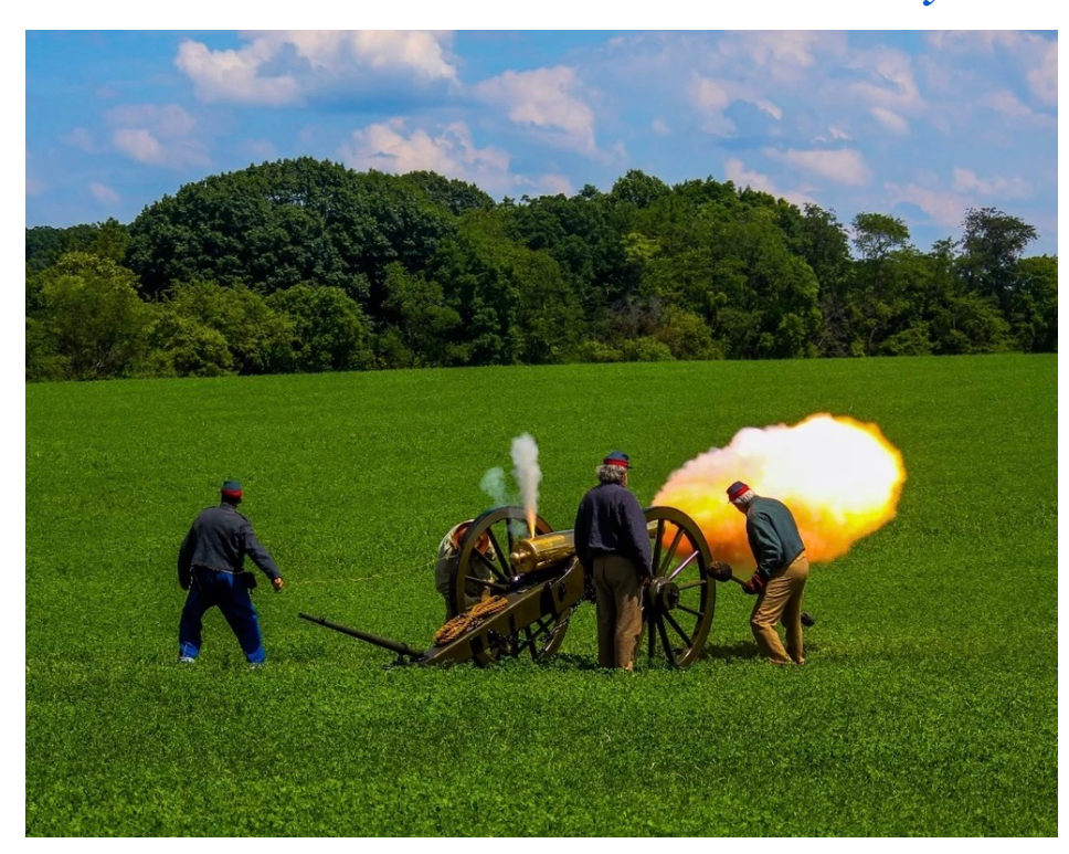
Artillery fire sounded from both sides of the Monocacy River during the 160<sup>th</sup> Anniversary celebration, July 5-7. Cannons fired at the Visitors Center were answered by others from the Thomas Farm.