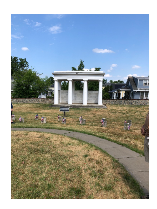
Our final stop of the day was at Battlefield National Cemetery, where several Federal soldiers that perished at the Battle of Fort Stevens are interred.