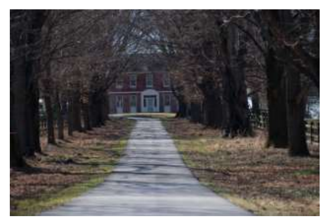
Entrance to Thomas Farm House